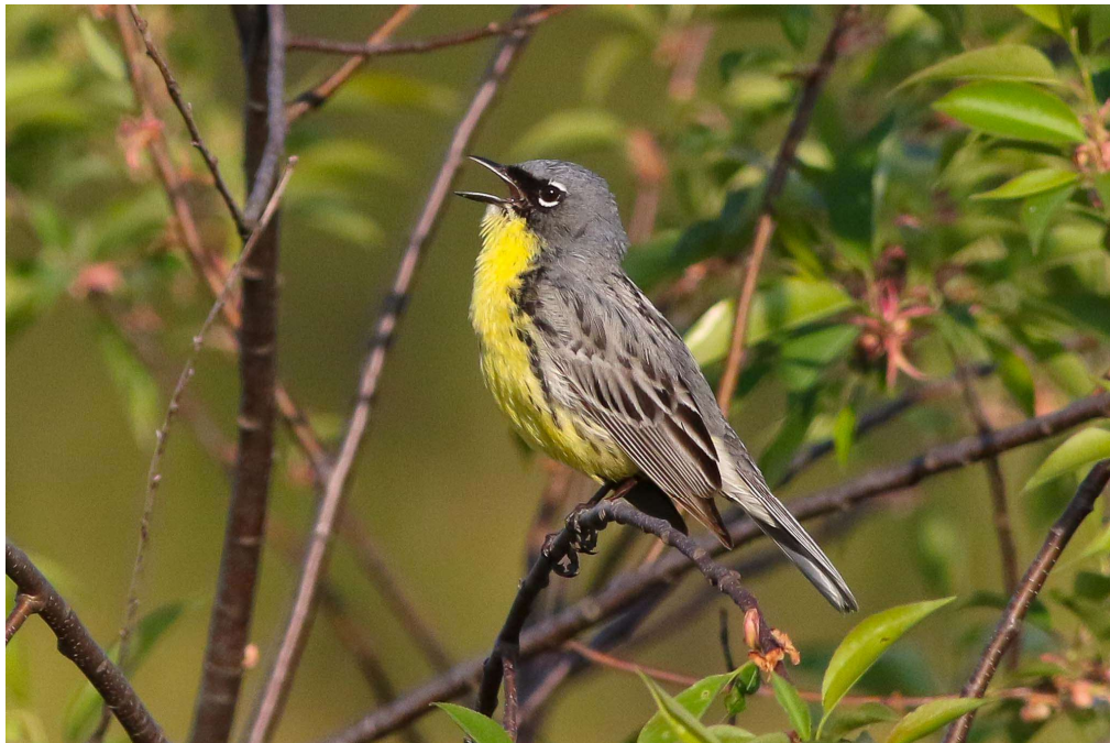
Kirtland's Warbler

Warblers are among the most popular groups of birds in North America. Their brilliant colors and energetic songs enliven spring mornings throughout much of the continent. This tour will celebrate the diversity of these wonderful birds, in a region that arguably holds the highest warbler abundance anywhere – up to 30 species are likely on this tour!