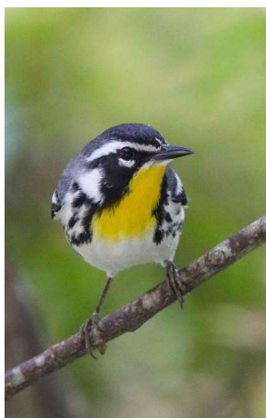
Yellow-throated Warbler

NIGHT: Holiday Inn Express, Cleveland Airport